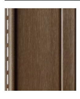
7" Board & Batten