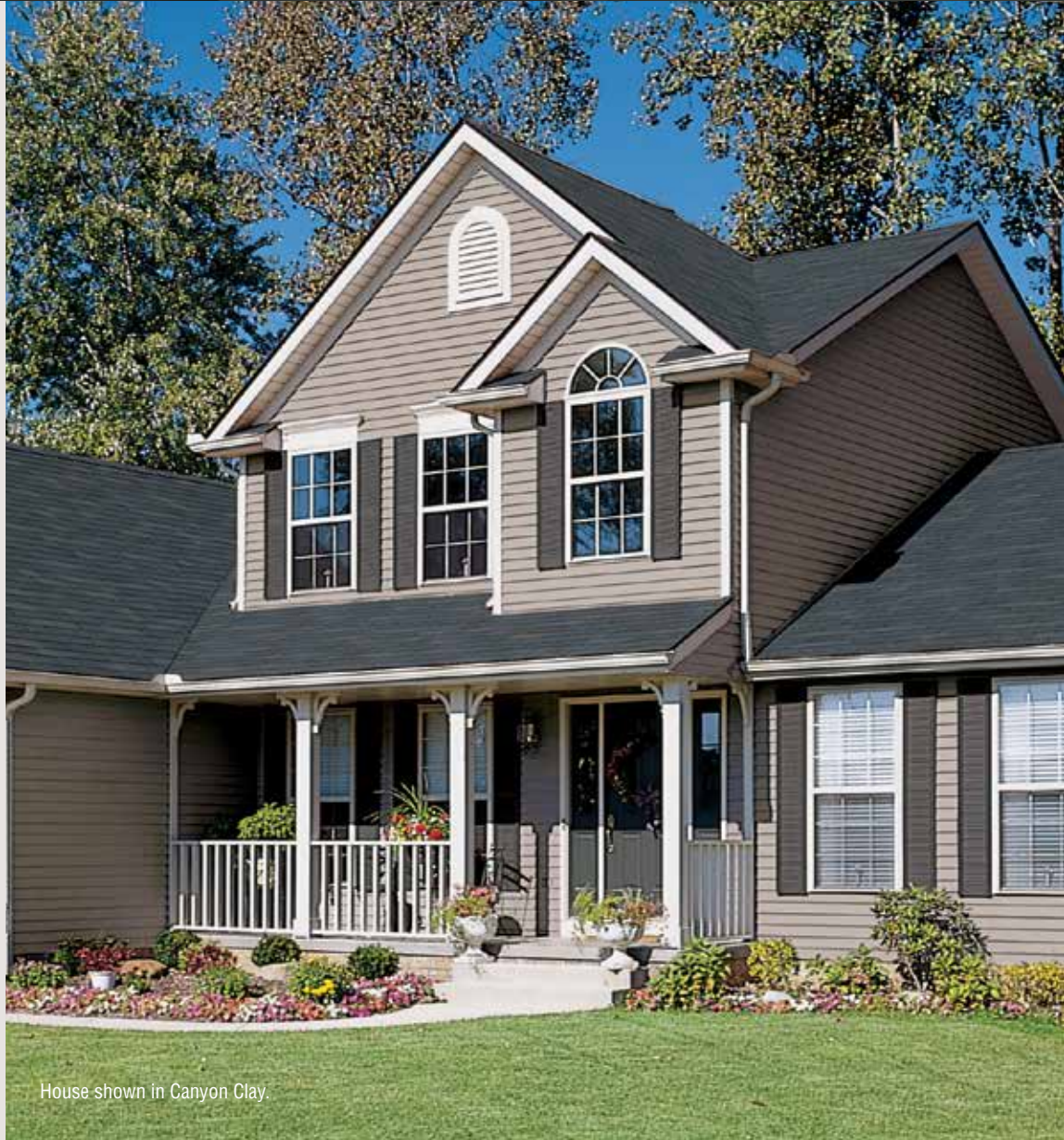
House shown in Canyon Clay.