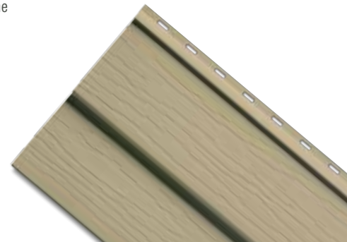
Double 4" Clapboard

Accent the architecture of your home with coordinating soffit, fascia and trim. Beautifully crafted exterior accessories will give your home a distinctive touch of personality and visual appeal.