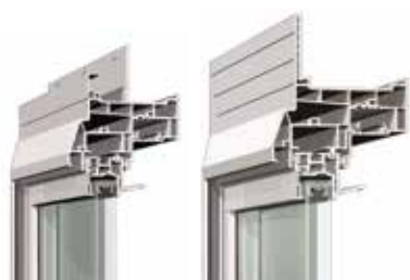
1-3/8" Nail Fin Set Back with J-Channel Adaptor