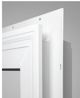
1900 Series Single-Hung with Nailing Fin and Integral Brickmould J-Channel