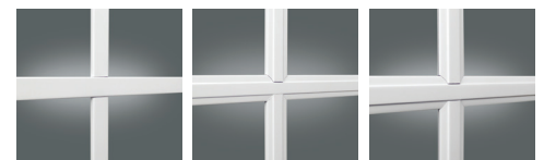
5/8" Flat 3/4" Contoured 1" Contoured