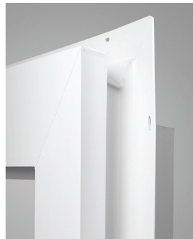
1900 Series Double-Hung with Nailing Fin (shown with optional 3-1/2" flat casing)