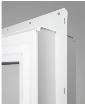
1700 Series Single-Hung with Nailing Fin

Choose from a variety of frame options to help streamline jobsite requirements for every type of construction, cladding and masonry projects. Gentek new construction windows are designed to simplify the contractor and builder experience by meeting today's design trends with ease.