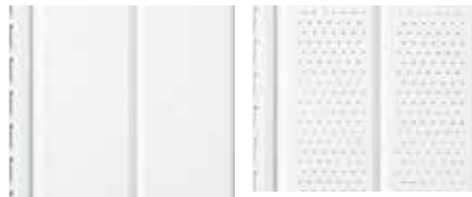
10" D-5 Solid Soffit/ Vertical Siding