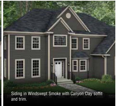
Siding in Windswept Smoke with Canyon Clay soffit and trim.