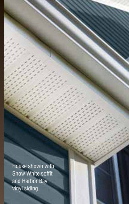
House shown with Snow White soffit and Harbor Bay vinyl siding.

Built weather-tough, Gentek soffit will protect the hard-to-reach areas of your home with a resilient finish that never needs to be painted. Choose solid and vented profiles to create the ideal soffit system for your home.