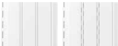
8" Solid Soffit