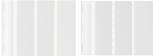
12" T-4 Solid Soffit/ Vertical Siding