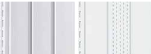
12" T-4 Solid Soffit/ Vertical Siding