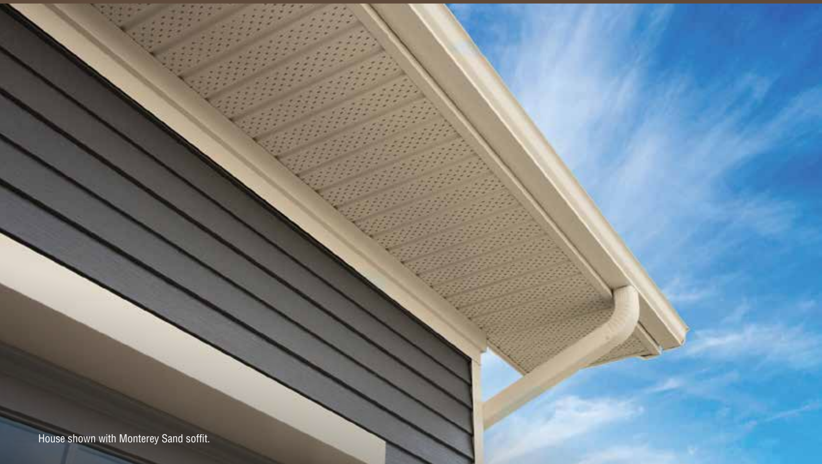
House shown with Monterey Sand soffit.

Rooflines, gables and trim areas command extra attention when adding visual interest and dimension to the architecture of a home. At the same time, these important areas require proper ventilation to allow moisture to escape from the eaves and rafters.