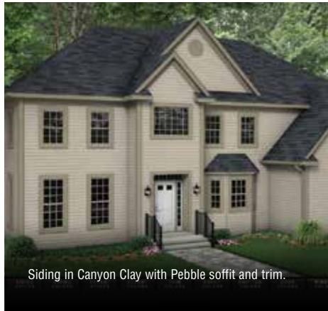
Siding in Canyon Clay with Pebble soffit and trim.