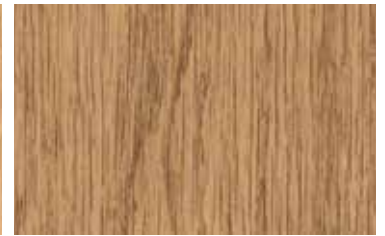
Dark Oak Woodgrain