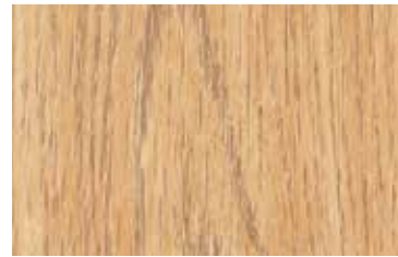
Light Oak Woodgrain