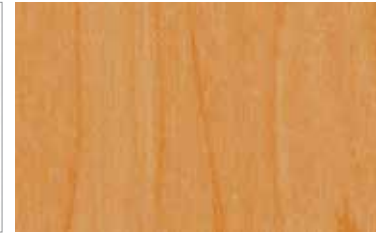
Rich Maple Woodgrain