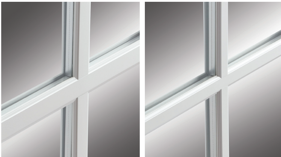
1-1/4" (above left) and 7/8" (above right) Simulated Divided Lite with mill finish shadow bar.