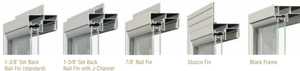
1-3/8" Set Back Nail Fin (standard)

70 Series windows come standard with a 1-3/8" set back nail fin. For ideal installations in a variety of applications, four additional options also are offered.