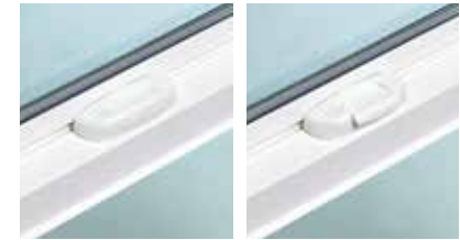
Optional PAL lock (shown locked and unlocked) makes it easy to close and lock the window in a single motion.