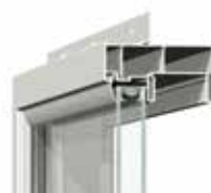
1-3/8" Set Back Nail Fin (standard)

80 Series windows come standard with a 1-3/8" set back nail fin. For enhanced appearance and ease of installation, three additional options are also offered.