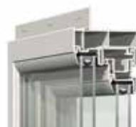
1" Set Back Nail Fin