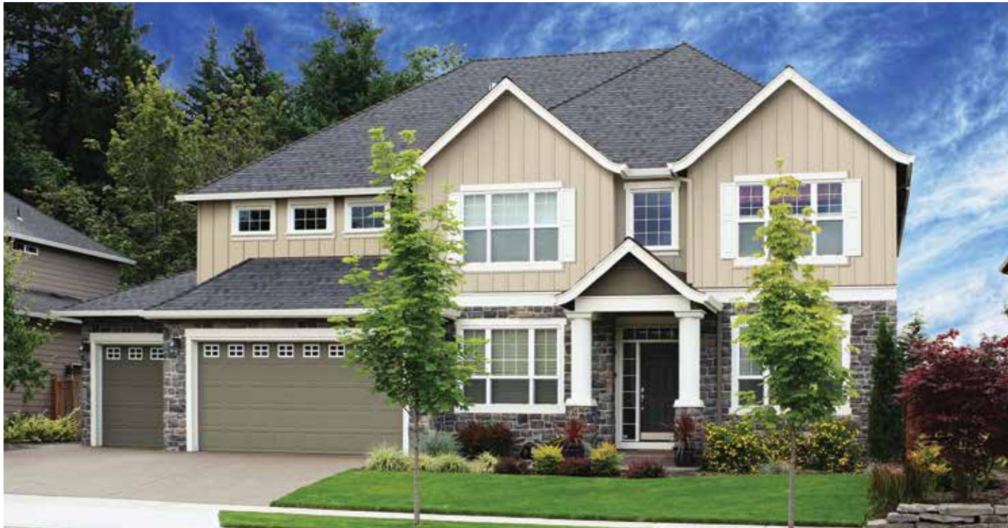
Our masterfully crafted 12" Vertical Board & Batten profile speaks to a variety of today's architecture, adding greater dimension and visual appeal.