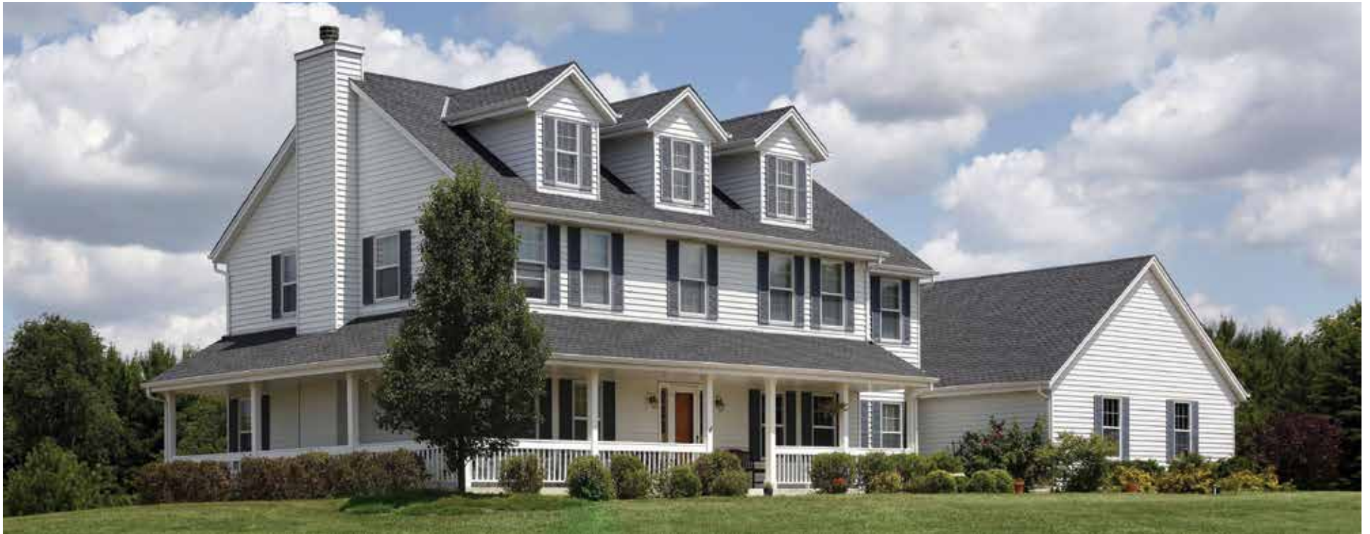
The traditional elegance of our Double 4", Double 5" and 8" Clapboard is accentuated with an inviting roughsawn texture. House shown in Double 4" Clapboard.

With an artful balance of form and function, SteelTek Supreme presents four distinctive profiles: Double 4" Clapboard, Double 5" Clapboard, 8" Clapboard and 12" Vertical Board & Batten. The high-style warmth of each panel is further enhanced with natural-looking wood textures and colors that mimic nature. Matching and complementing trim and accessories complete the design, inspiring a perfectly pulled-together finished look that truly stands apart.