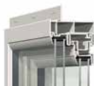
1" Nail Fin Setback