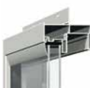
1-3/8" Nail Fin Setback (standard)

70 Series windows come standard with a 1-3/8" nail fin setback. For ideal installations in a variety of applications, four additional options also are offered.