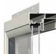
7/8" Nail Fin Setback