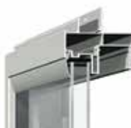
1-3/8" Nail Fin Setback with J-Channel