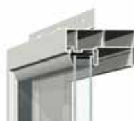
1-3/8" Nail Fin Setback (standard)

80 Series windows come standard with a 1-3/8" nail fin setback. For enhanced appearance and ease of installation, three additional options are also offered.